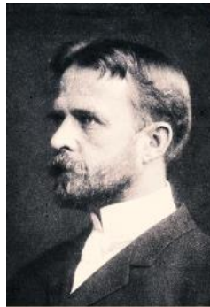
THOMAS H. MORGAN